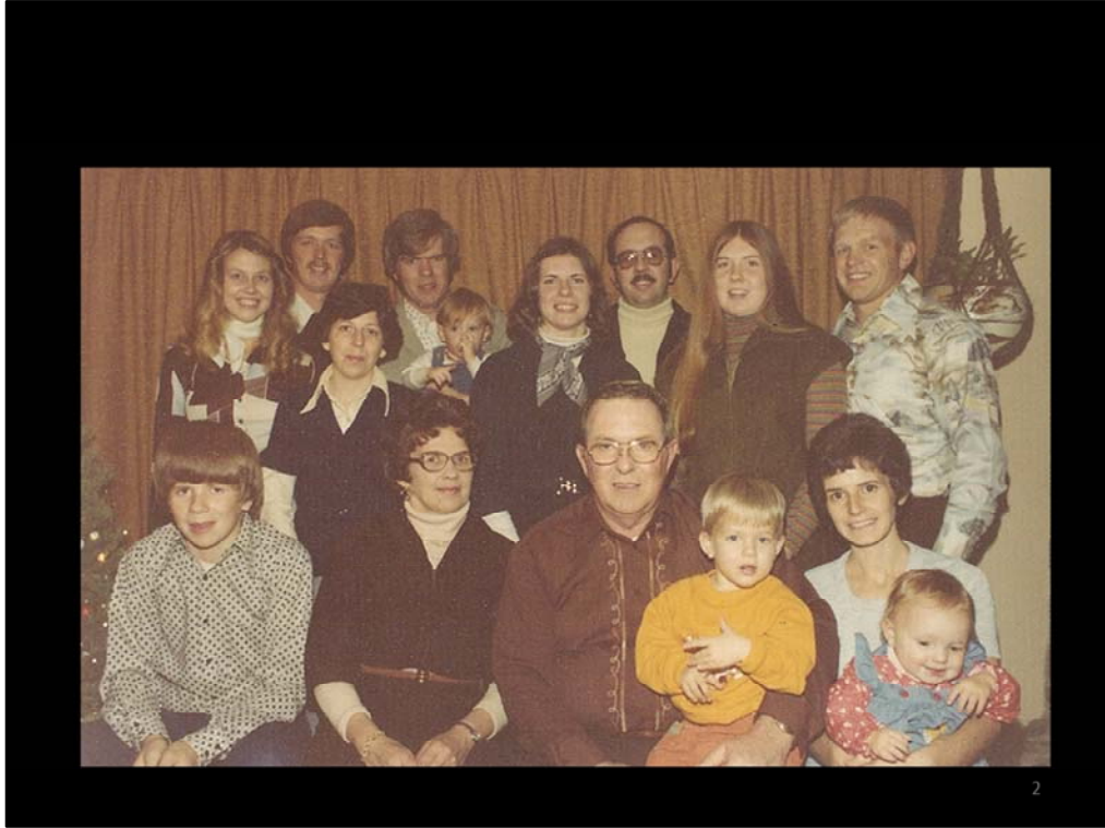
Upbringing had a big influence on who I am today